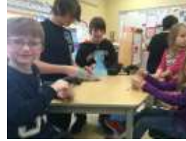
Making Ice Cream

I thought that including some of the fun things that are happening at Muskoka Falls would be a fun way to celebrate the students and staff.