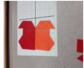
Flips and Symmetry in Math