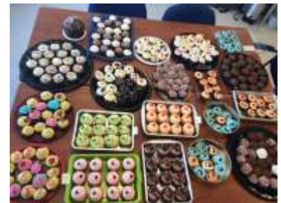
Cupcake Day to support the OSPCA