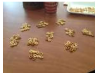
Happy 100th Day of School!!