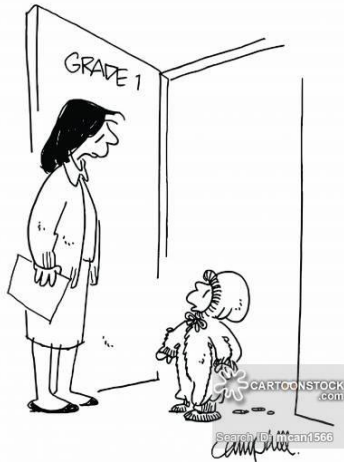
"My mom got it on. She said you'd get it off."

Mission Statement: We believe that together we are fostering a community of responsible, resilient global citizens with endless possibilities for success.