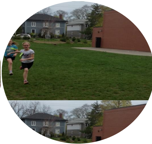
Track and Field Fun!